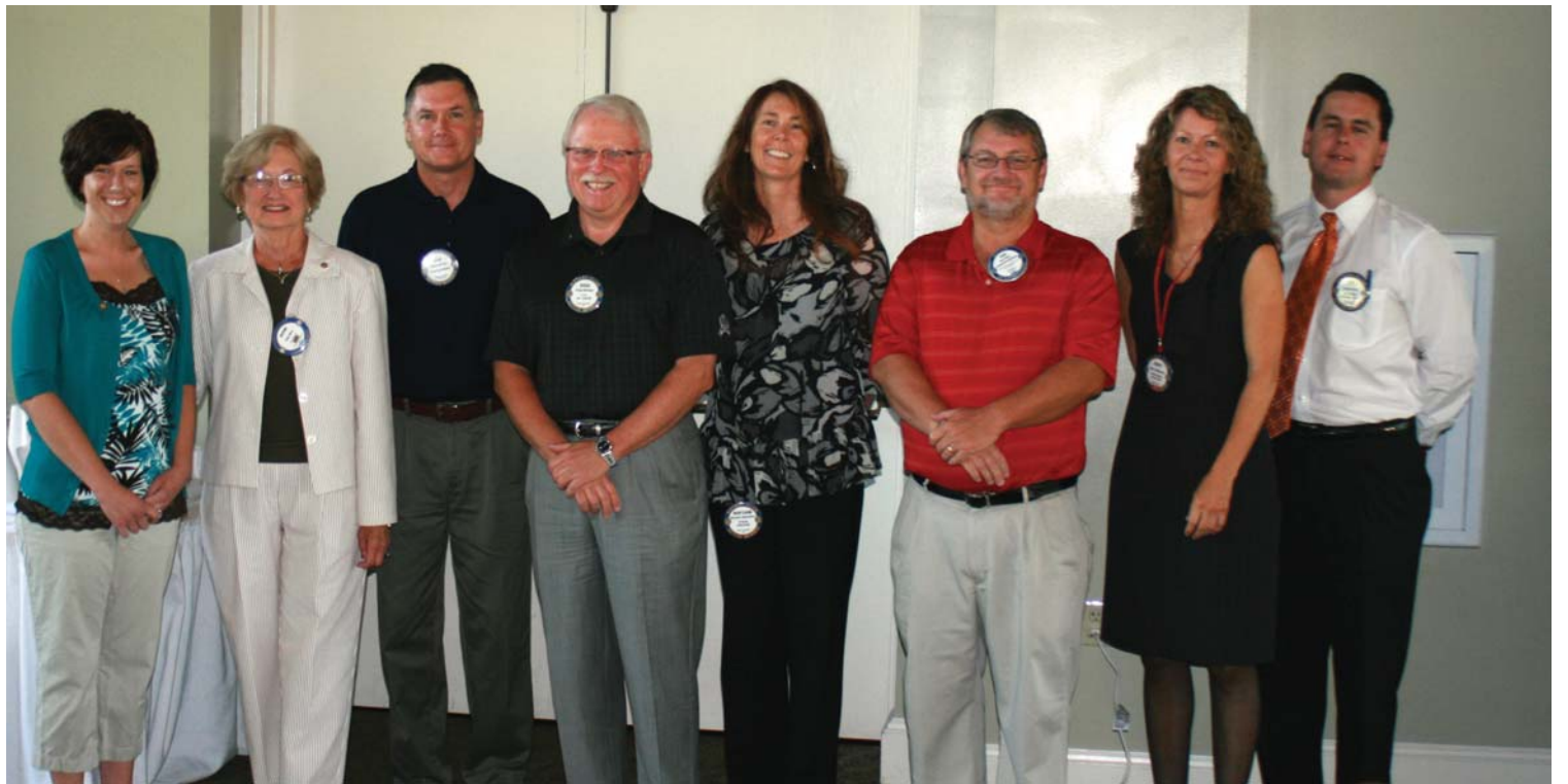
2010 - 2011 BOARD MEMBERS