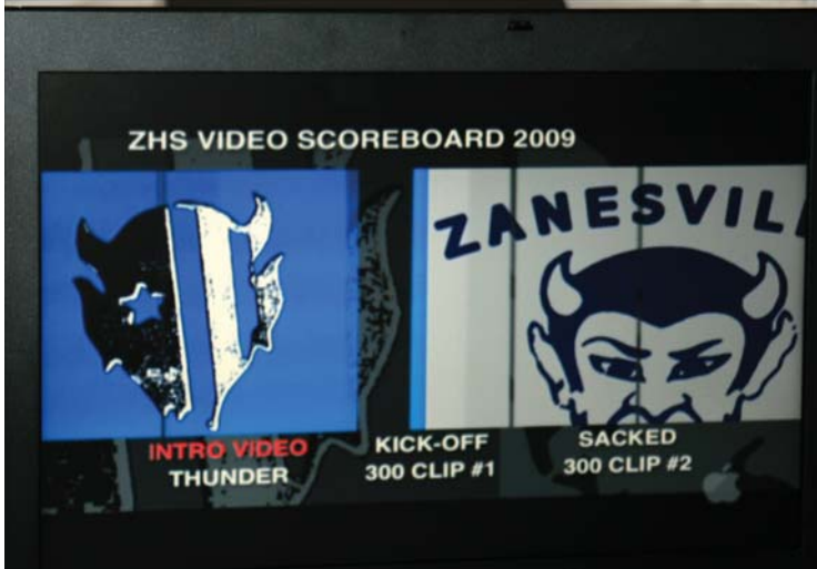
ZANESVILLE HIGH SCHOOL SCOREBOARD

The January 14th off site program will be held at Avon.